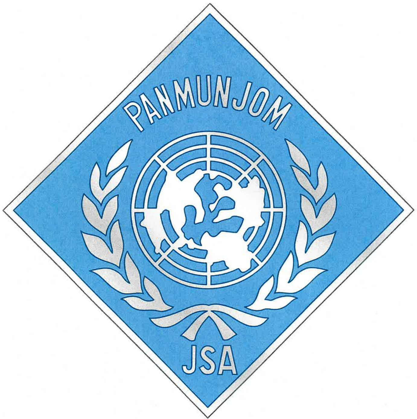
SIX TIMES SIZE