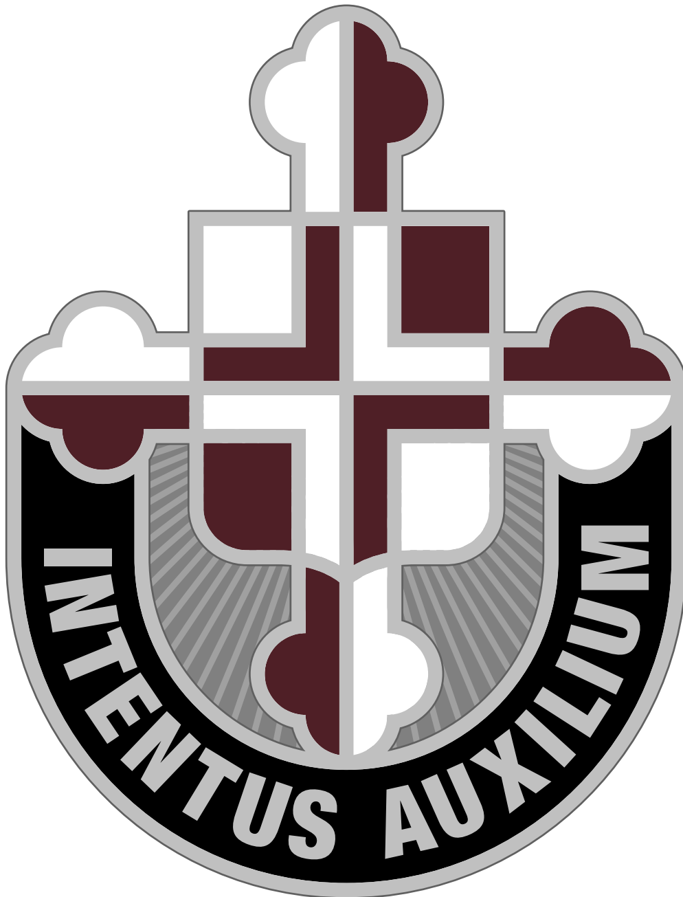
SIX TIMES SIZE