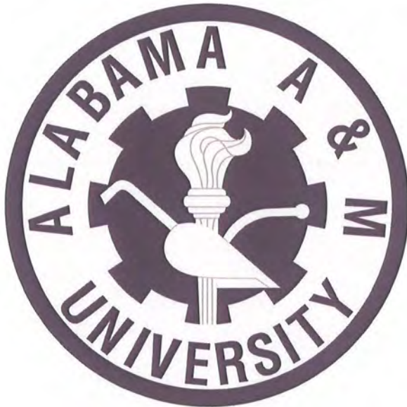
Shoulder Sleeve Insignia