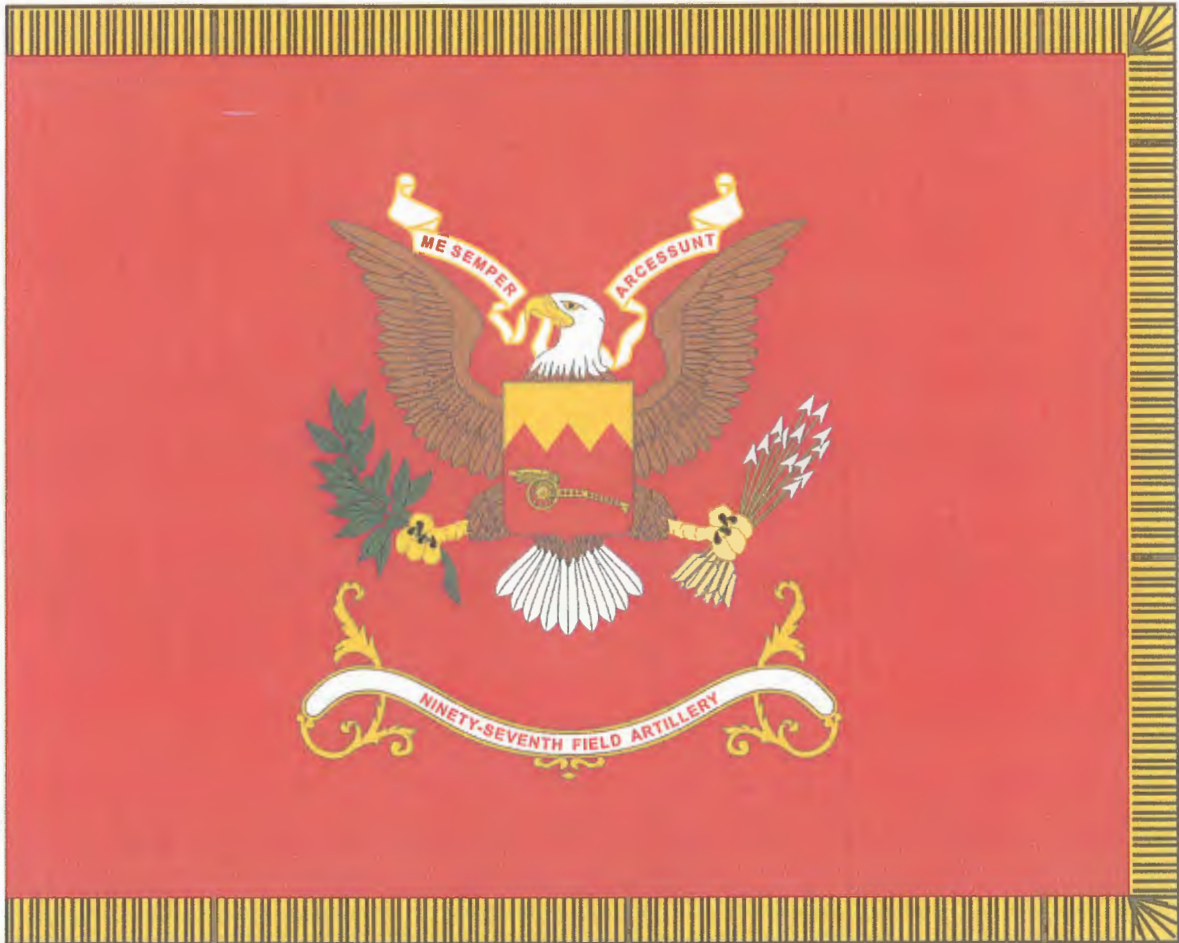
DISTINCTIVE UNIT INSIGNIA AND FLAG NINETY-SEVENTH FIELD ARTILLERY BATTALION