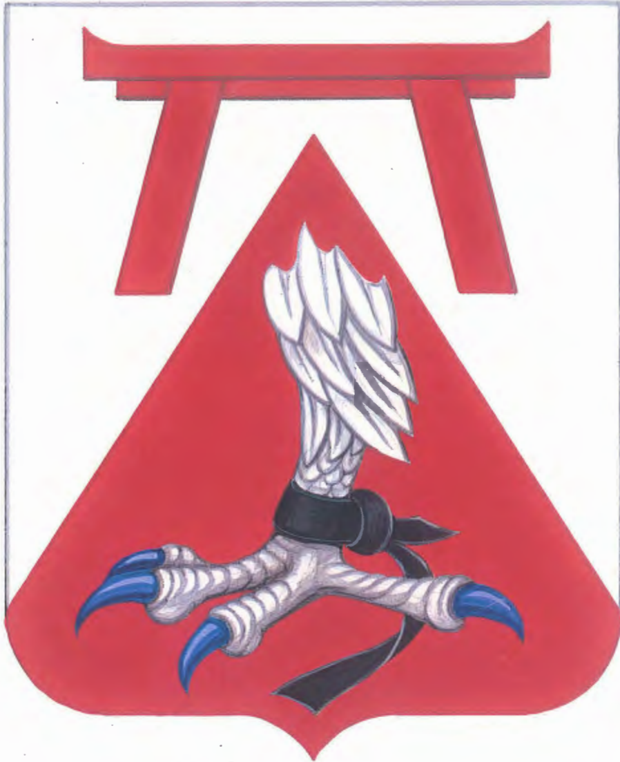
SUGGESTED DESIGN COAT OF ARMS 69TH ENGINEER BATTALION