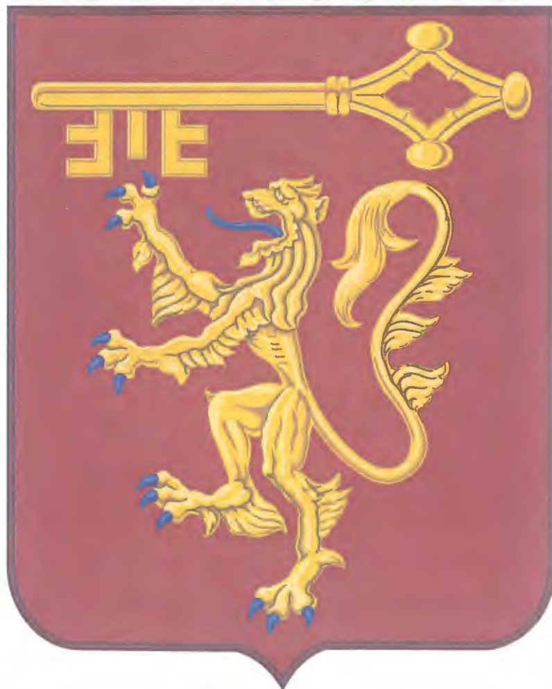
COAT OF ARMS 642D SUPPORT BATTALION NEW YORK ARMY NATIONAL GUARD