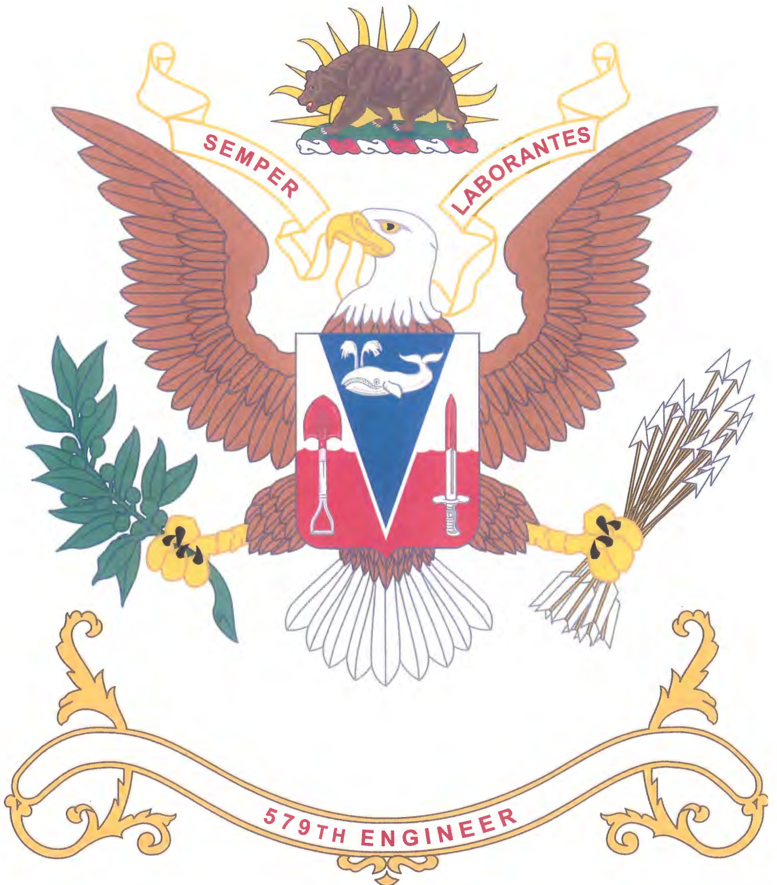
COAT OF ARMS 579TH ENGINEER BATTALION CALIFORNIA ARMY NATIONAL GUARD