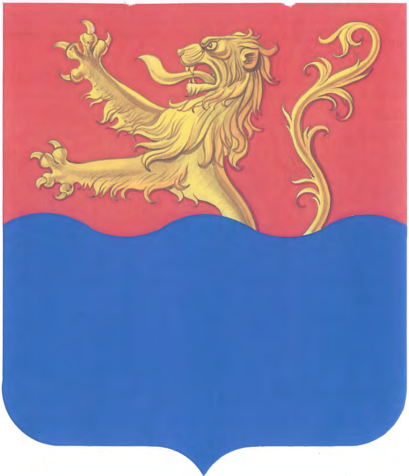
COAT OF ARMS FOR COLOR OF 516 TH INFANTRY BATTALION