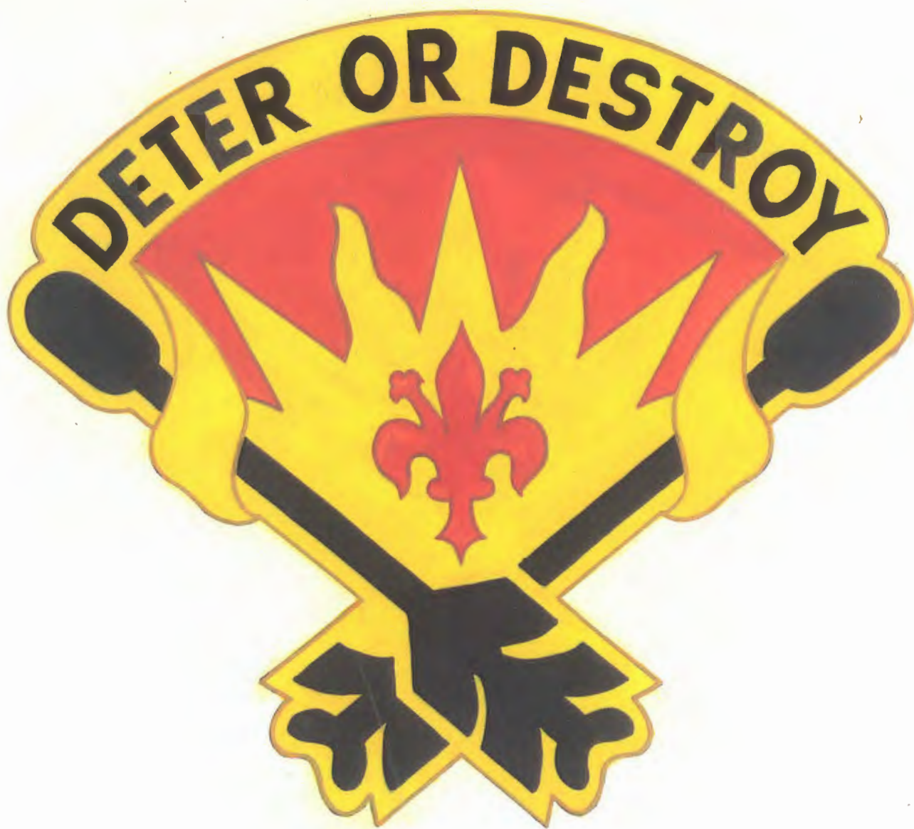
DISTINCTIVE UNIT BADGE 45TH AIR DEFENSE ARTILLERY BRIGADE