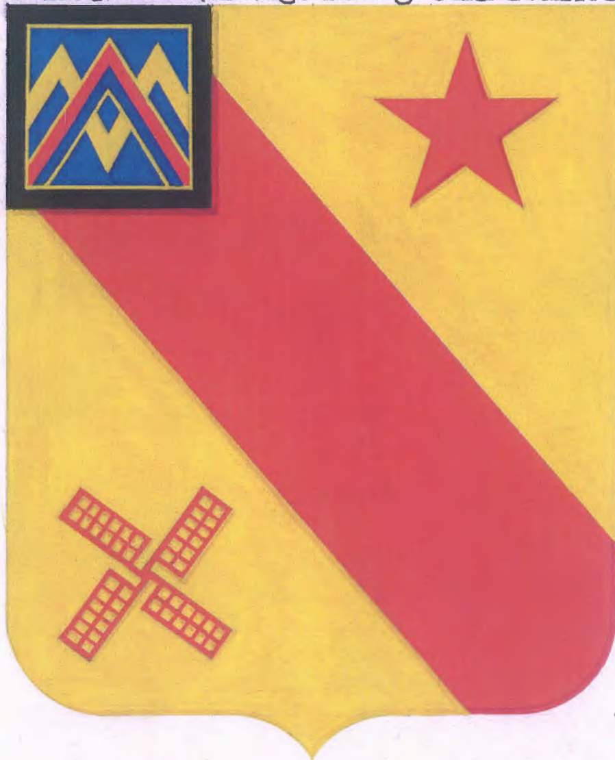
THIS COAT OF ARMS IS PREPARED FOR THE STANDARD OF THE 303 RD REGIMENT CAVALRY IT IS FULL SIZE AND IN PROPER RELATION TO THE HEAD OF THE EAGLE.

That for the regiments of the Organized Reserve: On a wreath of t (or and gules) the Lexington Minute Man proper. W. Toujours Prêt et Audacieux (Always Ready and Fearless)