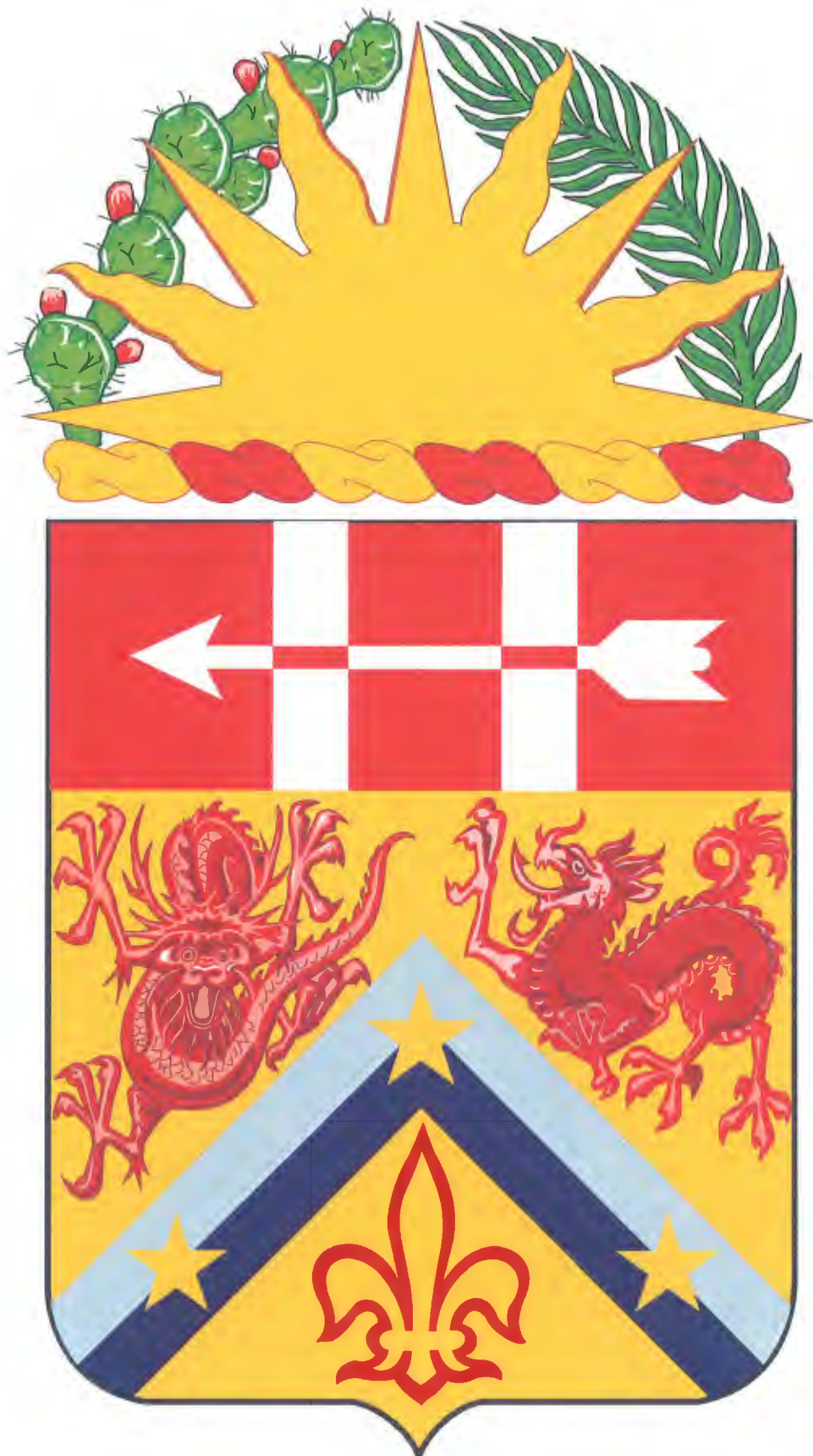
3D ARTILLERY REGIMENT COAT OF ARMS