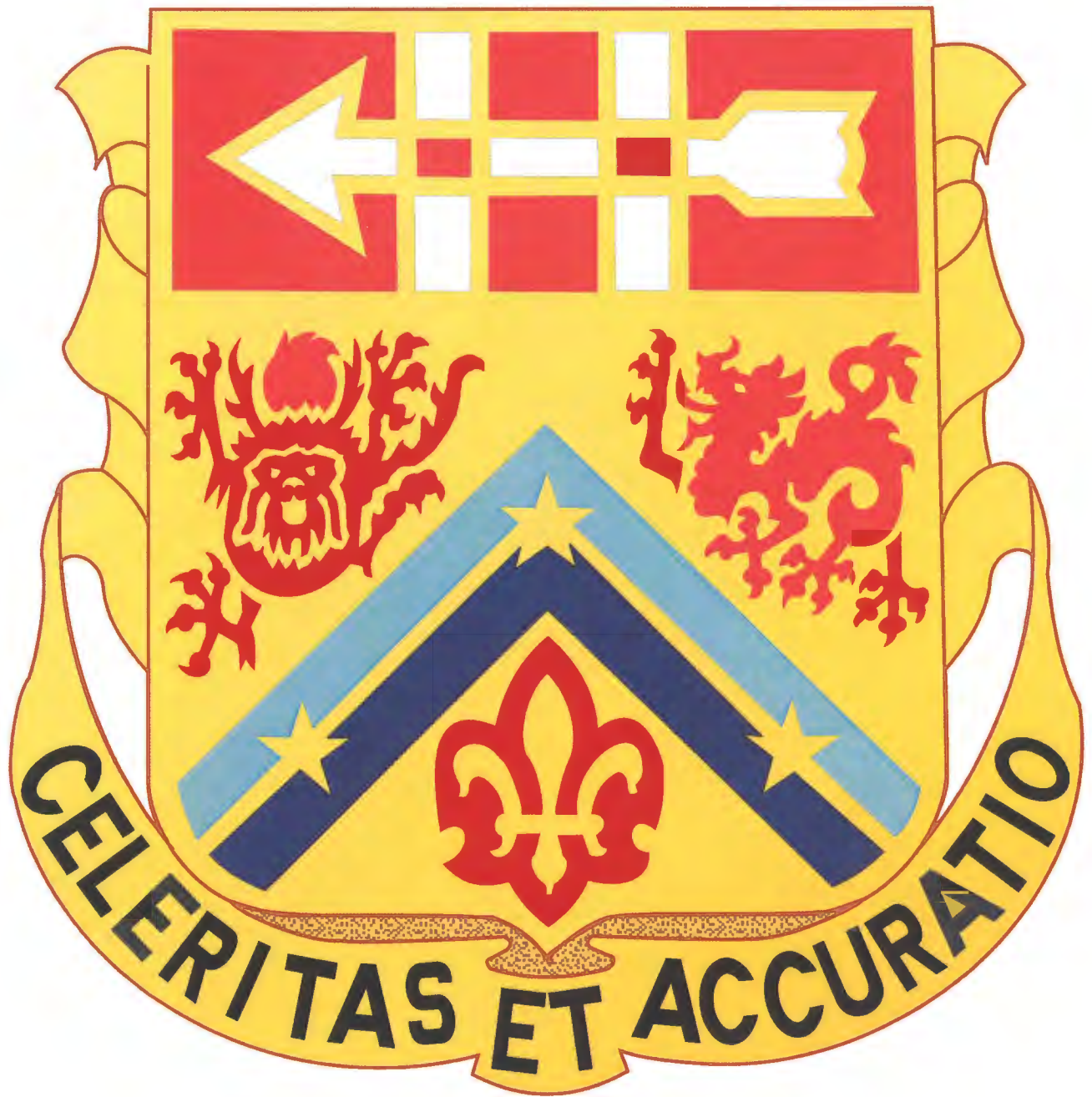
3D ARTILLERY REGIMENT DISTINCTIVE UNIT INSIGNIA