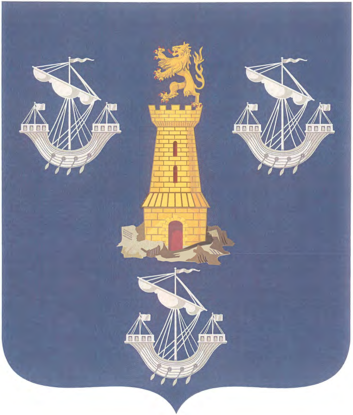
COAT OF ARMS 295TH INFANTRY REGIMENT UNITED STATES ARMY