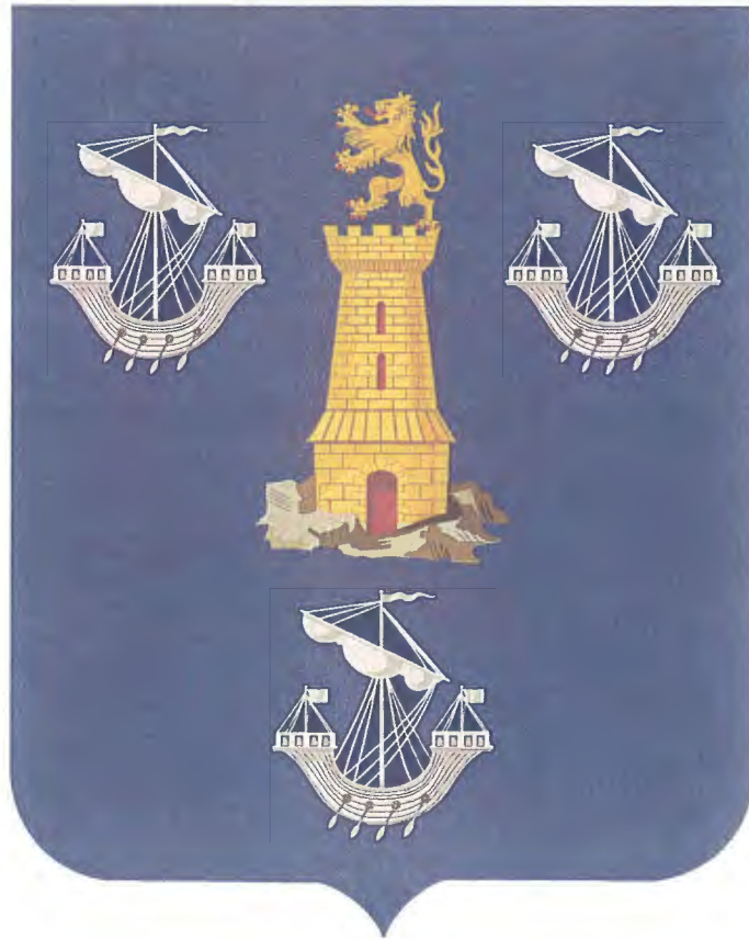
COAT OF ARMS 295TH INFANTRY REGIMENT UNITED STATES ARMY