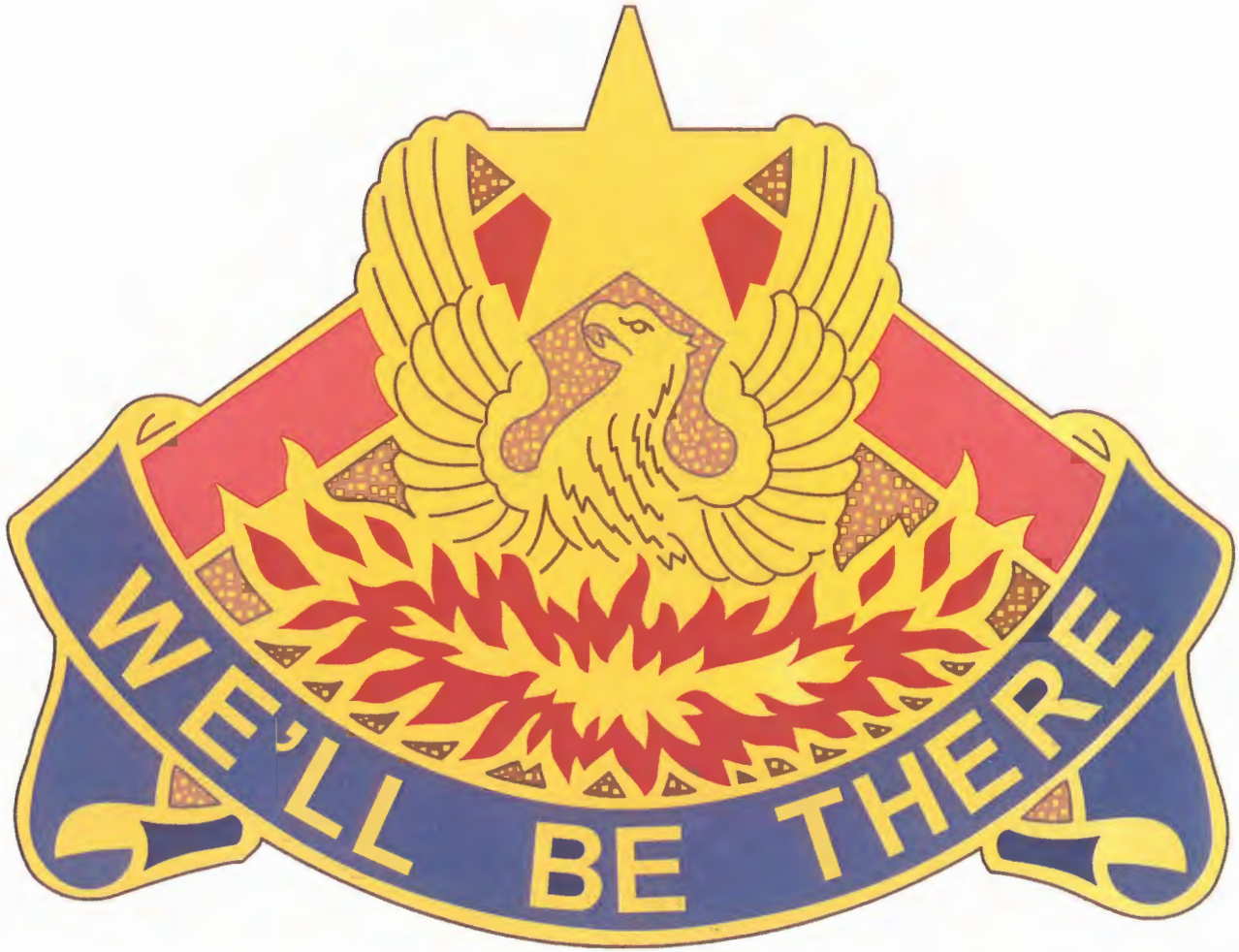
DISTINCTIVE UNIT INSIGNIA 164TH SUPPORT COMMAND Group