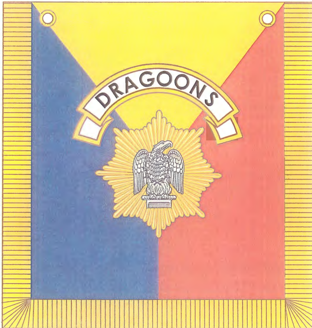
TABARD 113TH ARMY BAND