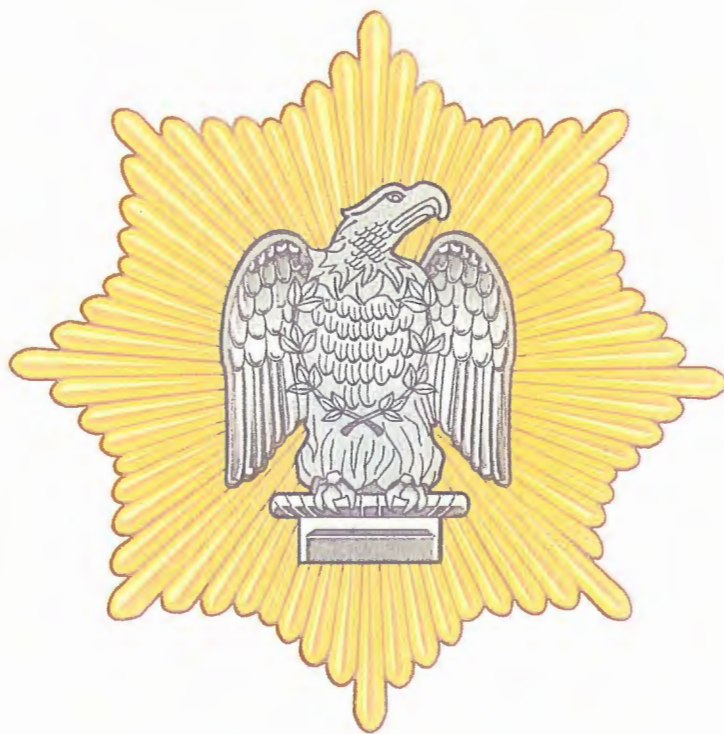
BADGE 113TH ARMY BAND