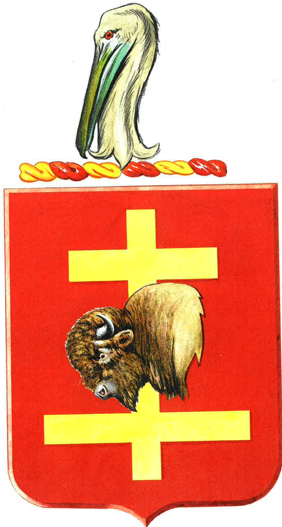
COAT OF ARMS FOR STANDARD OF 503 RD FIELD ARTILLERY BATTAL