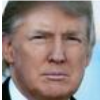
Donald J. Trump

President Trump suggested loosening the laws on treason 8 and ominously promised to review SGT Bergdahl's case. 9 He asserted that SGT Bergdahl had defected to the enemy, 10 saying "he went to the other side" and "negotiated with terrorists." He called him "the worst," 11 "no good," "this bum," a "whack job," "this piece of garbage," and a "son of a bitch." 12 In President Trump's eyes, SGT Bergdahl is "a very bad person who killed six